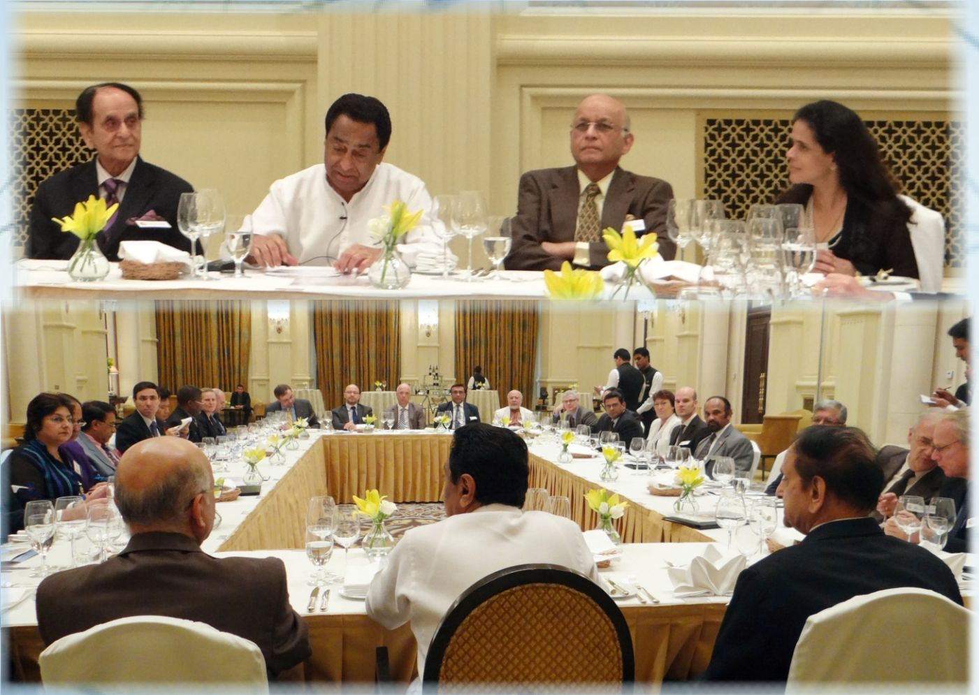
Above 2 photographs: AFI meeting with Minister of Urban Development Mr. Kamal Nath at the Leela Palace