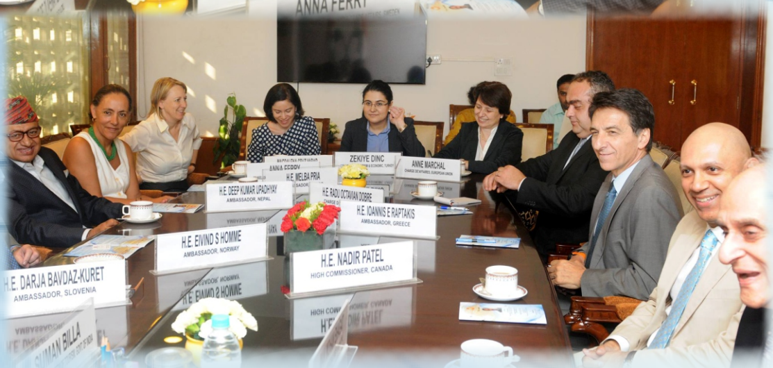
Above 2 photographs: AFI meeting with Dr. Mahesh Sharma, Minister of State (IC), Ministry of Culture & Tourism at Transport Bhawan, in Chair in top photograph.