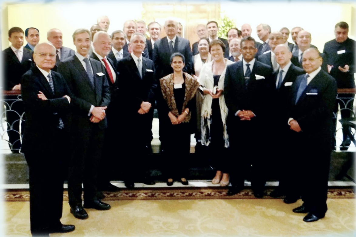
Dinner hosted in honour of Ambassadors Forum Reception to meet External Affairs Minister Salman Khurshid (2nd row middle) at the Claridges Hotel.